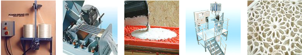
A=Alkali Resistant R=Roving 5000=Roving Tex in g/1000m H530X=Sizing

AR5000H530X is the popular premix fibre but in roving form. This allows the customer to chop the fibre to the desired length. This fibre can also be dispensed directly into the mixer via a multi roving chopping system.